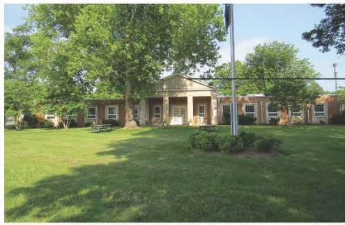
Gable form to mark central volume; sitting on four column/pier elements