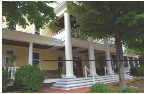
Linear, tiered porch element along front of building; ties in to central gable feature