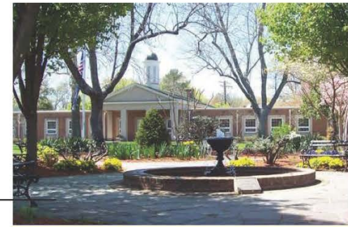
Incorporation of park-like setting around building on two sides