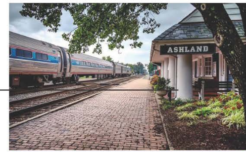
Paver-lined path along front of building with colonnade to define entrance & porch elements