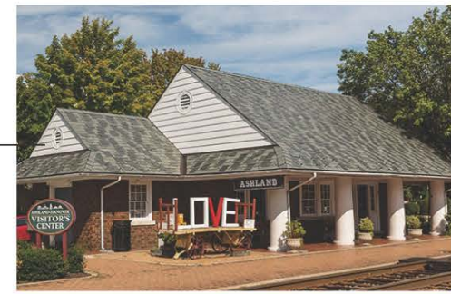
"Stacked" hip roofs of Train Station, with gable end-walls and shingle/slate roofing