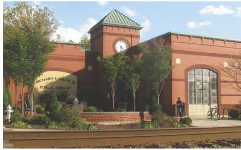
Brick detailing and window openings reference 19th c. architectural styles